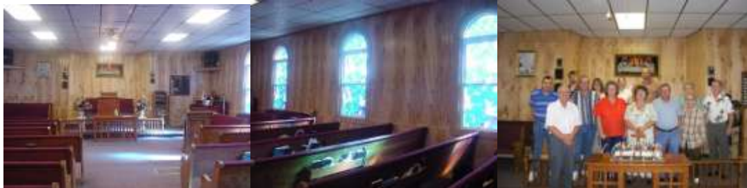
Inside Beartown Memorial Church September 2007

Many of the names listed in this History can be found in this listing of the Beartown Cemetery Beartown Cemetery, Wyoming Co, WV http://ftp.rootsweb.com/pub/usgenweb/wv/wyoming/cemetery/bailey.txt