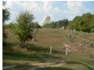
Beartown Cemetery 2007

Many of the names listed in this History can be found in this listing of the Beartown Cemetery Beartown Cemetery, Wyoming Co, WV http://ftp.rootsweb.com/pub/usgenweb/wv/wyoming/cemetery/bailey.txt